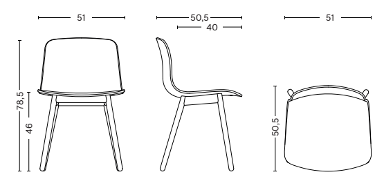
WIDTH 51 CM | 20.08" DEPTH 50,5 CM | 19.88" HEIGHT 78,5 CM | 30.91" SEAT HEIGHT 46 CM | 18.11" SEAT DEPTH 40 CM | 15.75"